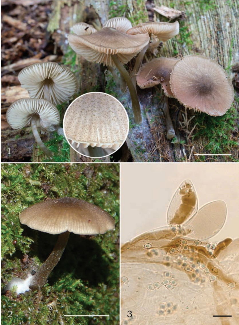
Plate I. Entoloma piceinum O. V. Morozova, Voronina et Arslanov. 1 — basidiomata (LE 254131, holotype); 2 — basidioma (LE 254132), photo by V. P. Prokhorov; 3 — terminal cells of the pileipellis (from LE 254131, holotype). Scale bars: 1, 2 — 1 cm; 3 — 10 \mu m.